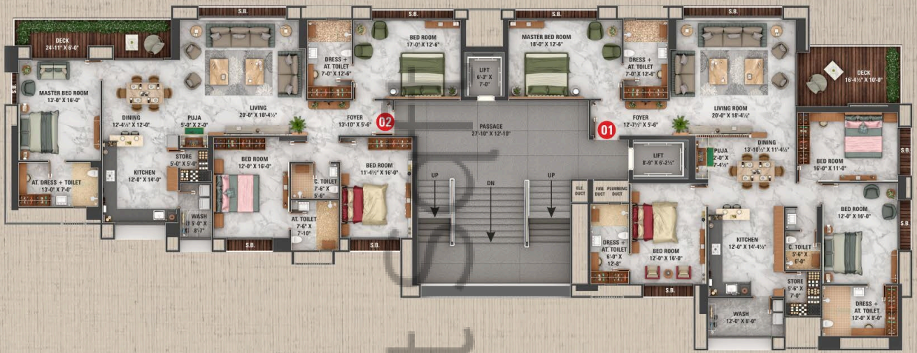
N → FLOOR PLAN | BUILDING A 1ST | 4TH | 7TH & 11TH FLOOR