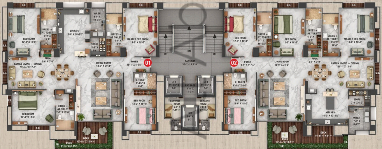
N FLOOR PLAN | BUILDING B 4TH | 7TH & 11TH FLOOR