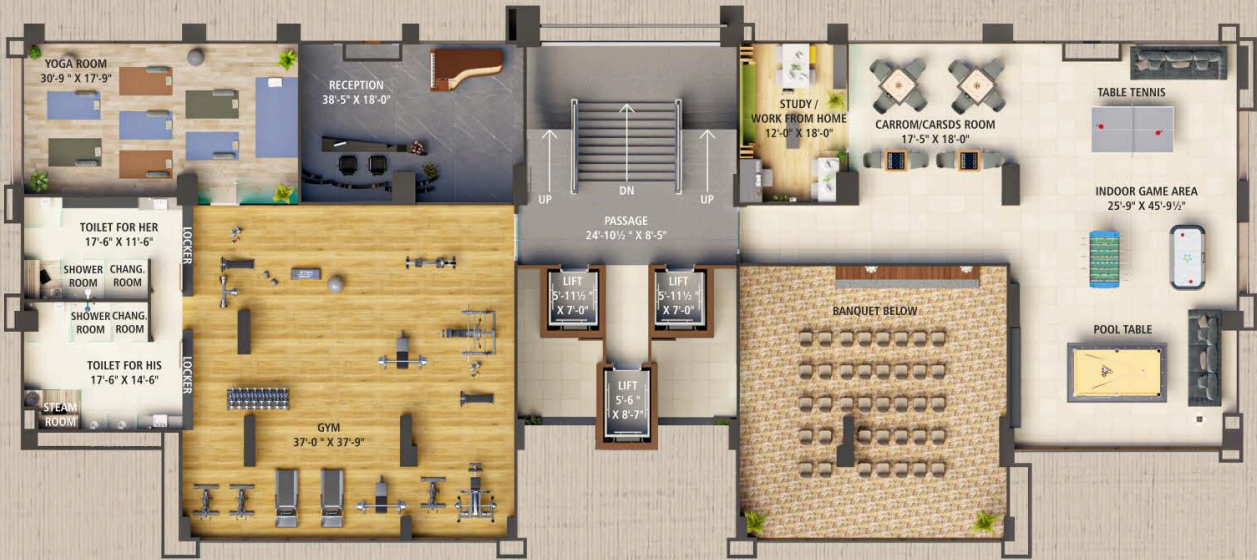
CLUB HOUSE | BUILDING B 1ST FLOOR