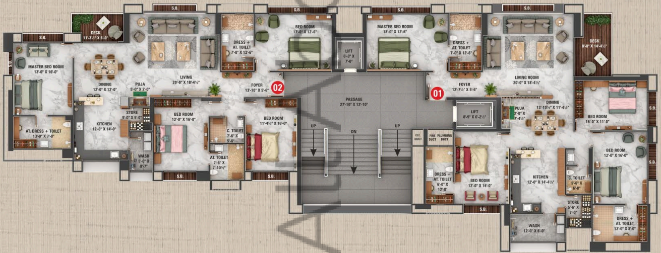
N → FLOOR PLAN | BUILDING A 2ND | 3RD | 5TH | 6TH | 8TH | 9TH | 10TH | 12TH | 13TH | 14TH | 16TH & 17TH FLOOR