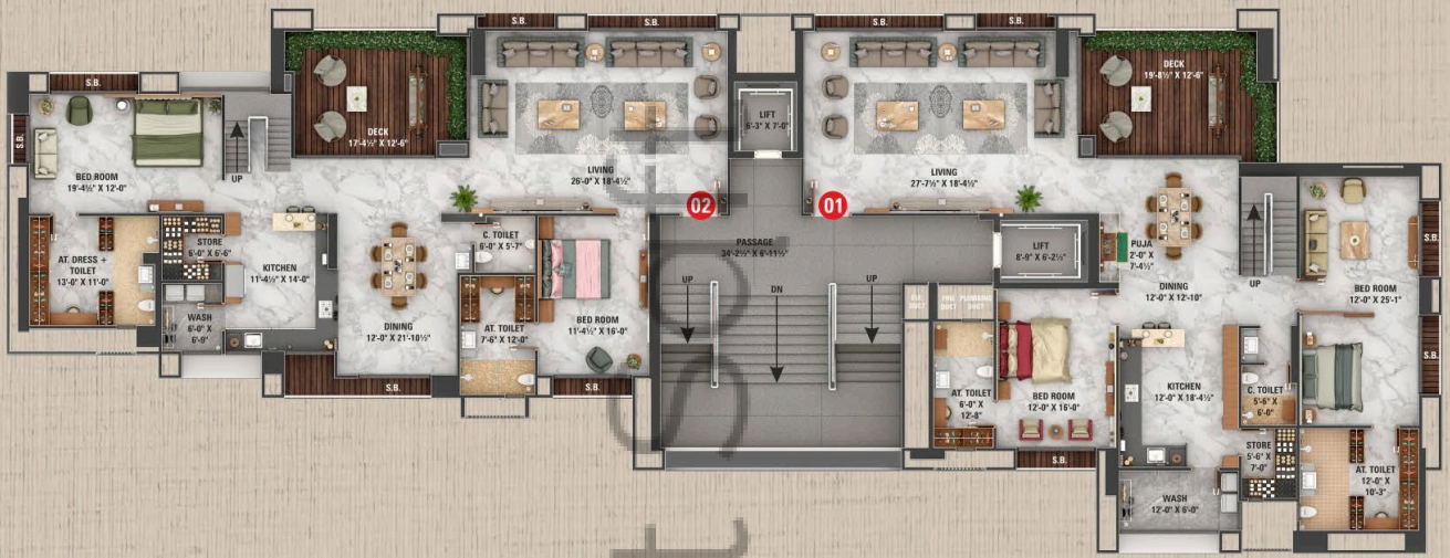
PENTHOUSE | BUILDING A 18TH FLOOR