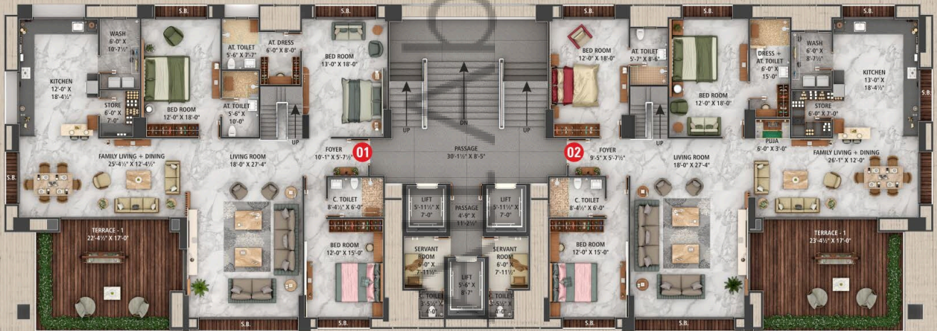
N PENTHOUSE | BUILDING B 18TH FLOOR