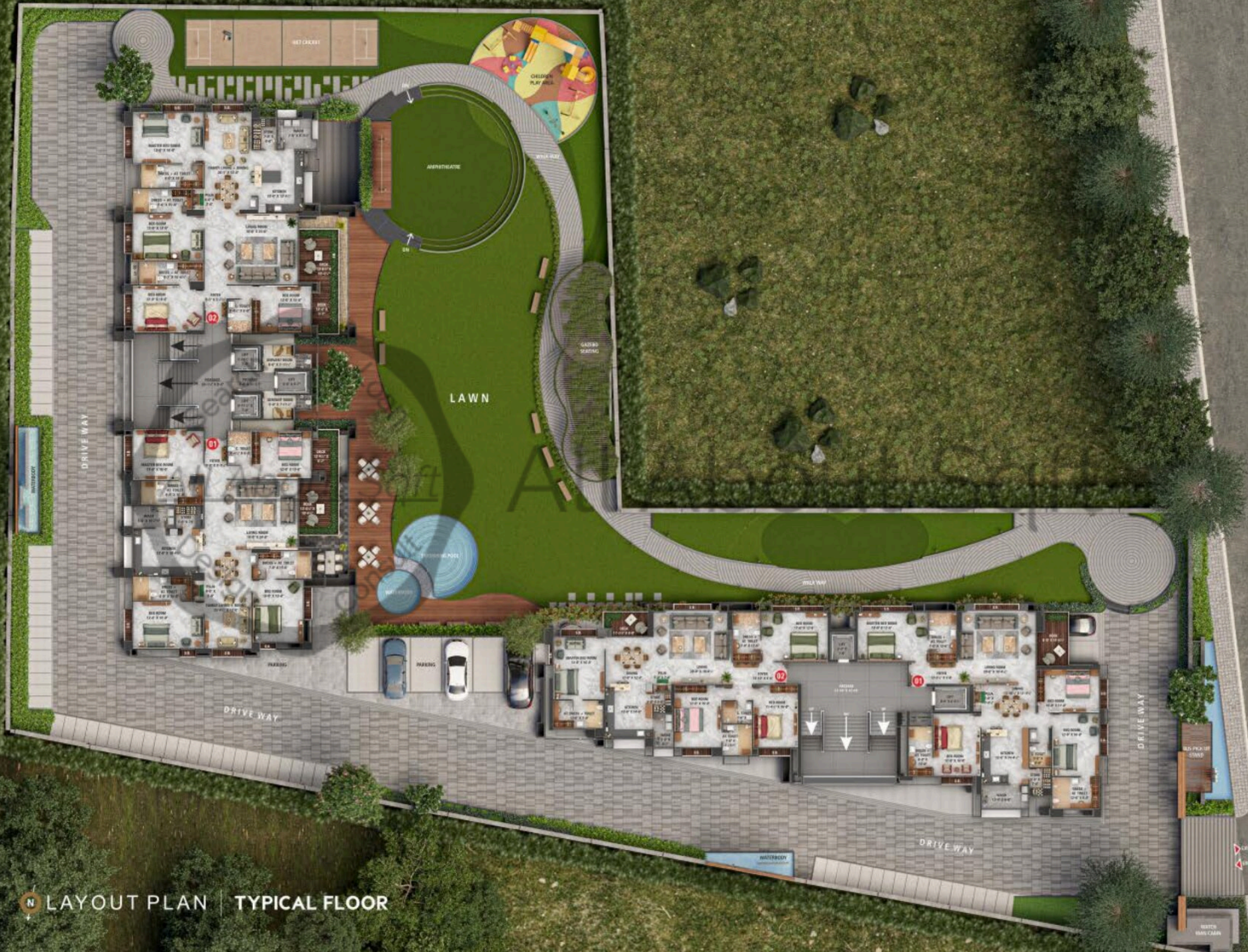
N LAYOUT PLAN | TYPICAL FLOOR