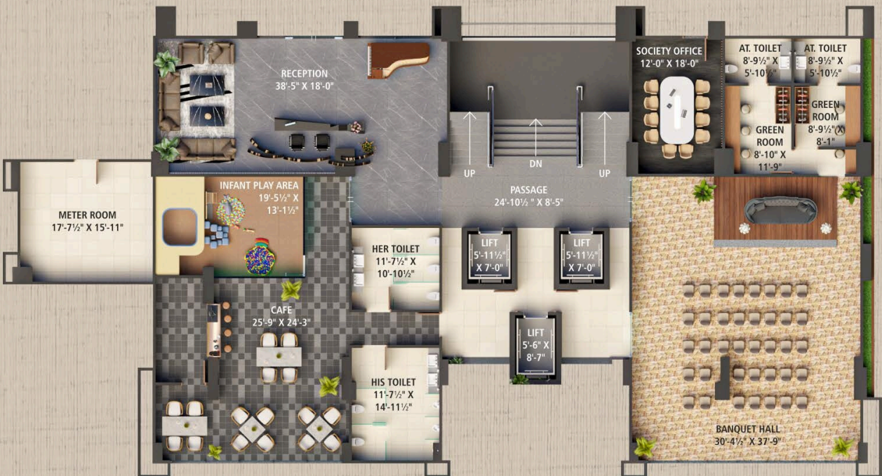
CLUB HOUSE | BUILDING B GROUND FLOOR