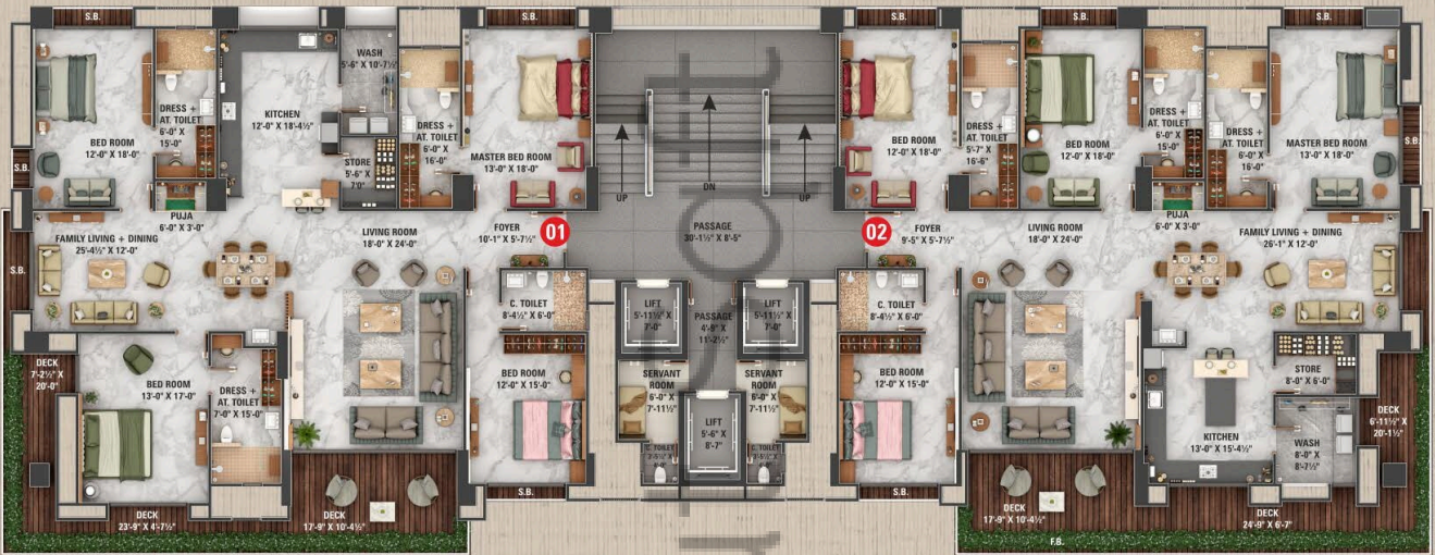
N FLOOR PLAN | BUILDING B 15TH FLOOR