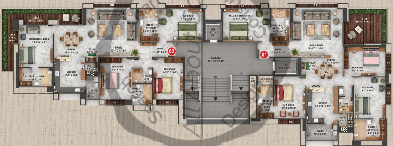
N → FLOOR PLAN | BUILDING A 15TH FLOOR