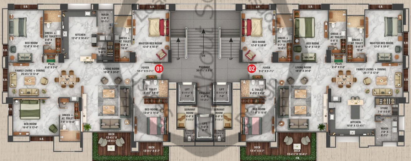
N FLOOR PLAN | BUILDING B 6TH | 9TH & 13TH FLOOR