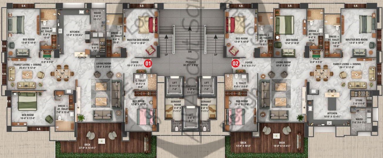
FLOOR PLAN | BUILDING B 2ND FLOOR