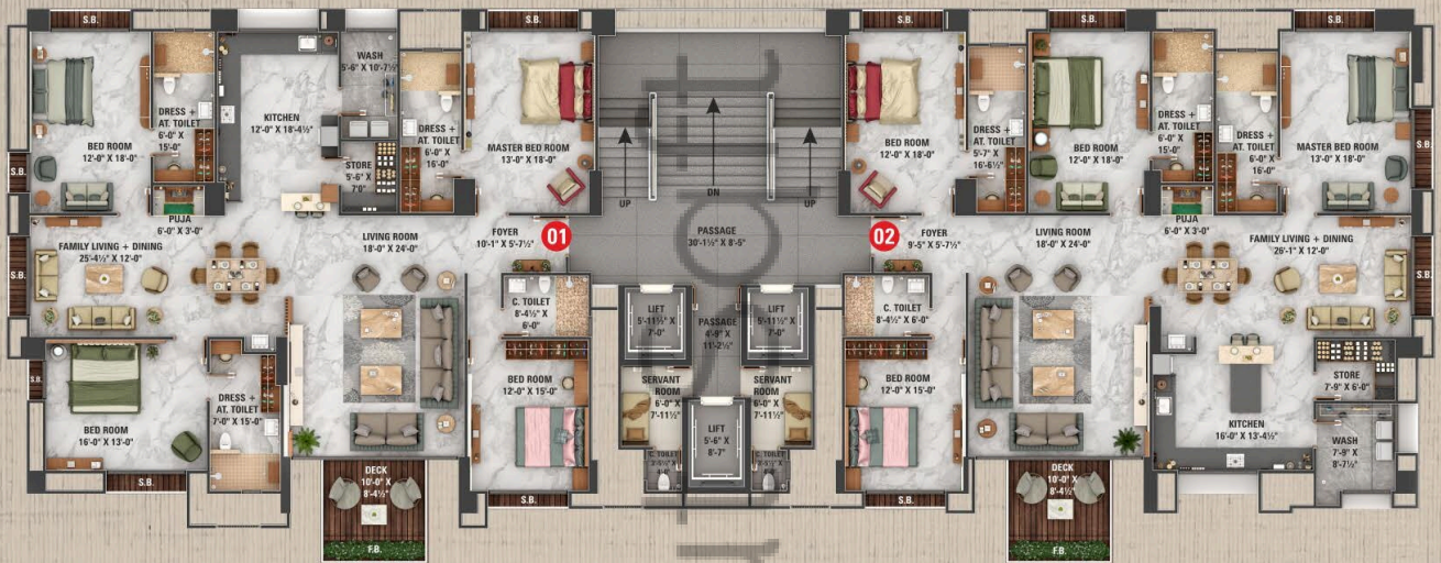
N FLOOR PLAN | BUILDING B 3RD | 5TH | 8TH | 10TH | 12TH | 14TH | 16TH & 17TH FLOOR