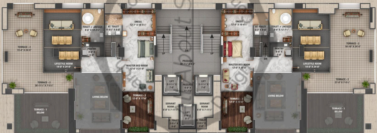
N PENTHOUSE | BUILDING B 19TH FLOOR